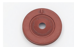
(3) V-ring mixer 078995