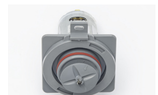
Mixer motor 33.2872.5000

NOTE The necessary spare parts can be ordered free of charge from Sales Export Switzerland until 1 July 2020 by quoting the serial number.