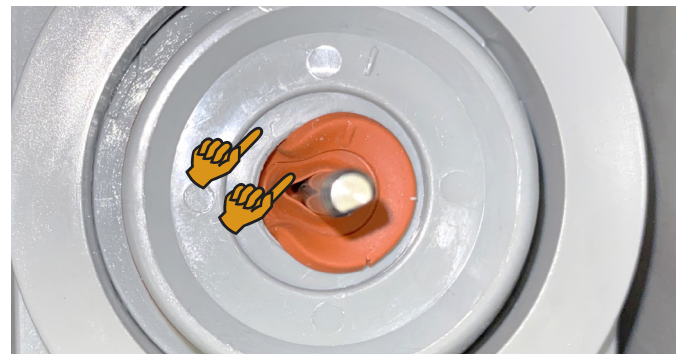
Incorrectly mounted V-ring