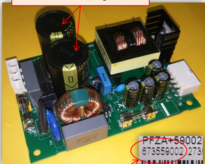
Label detail (back side)